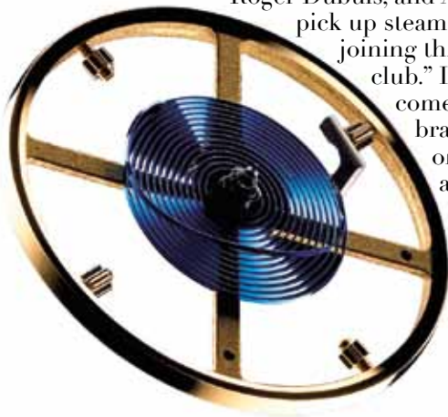
Right: A. Lange & Söhne is one of those who manufactures its own hairsprings. Left: The parachrom hairspring from Rolex.